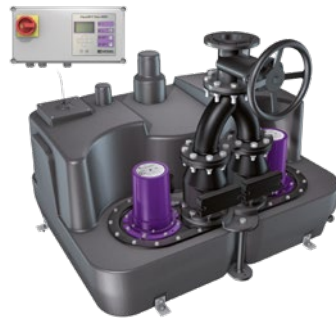
Illustration shows Duo version with cast iron closure valve

➤ Note: Also available in 60 Hz / 400 V page 108