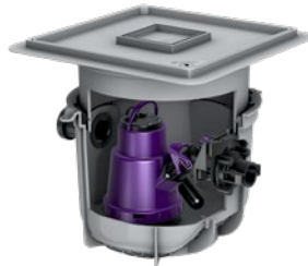
Illustration shows Art. no. 280 570X

Single removable KTP pump for wastewater without sewage, float switch, with multi-vane impeller, with integrated non-return flap, pressure pipe connection 40 mm.