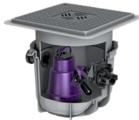
Illustration shows Art. no. 280 570S