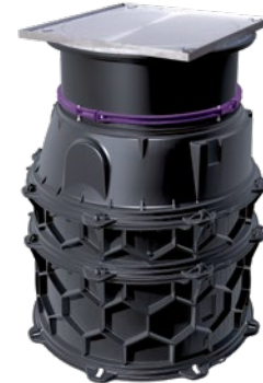
Illustration shows Art. no. 874 00 20