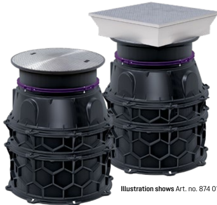
Illustration shows Art. no. 874 01 43

Note: Additional installation depths, upper sections and covers class B / D (on request)