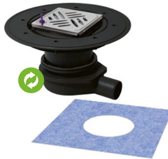
Illustration shows Art. no. 44 700.53 with Lock & Lift locking system

Design cover Kessel 120 × 120 mm (anti-slip class R9 according to DIN 51130; anti-slip class C according to DIN 51097) and rim made of stainless steel AISI 304 (rim height: 10 – 23 mm), class L 15