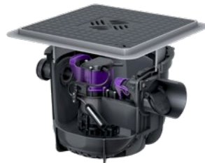
Illustration shows Art. no. 280 451S