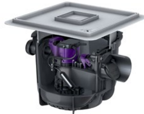
Illustration shows Art. no. 280 451X