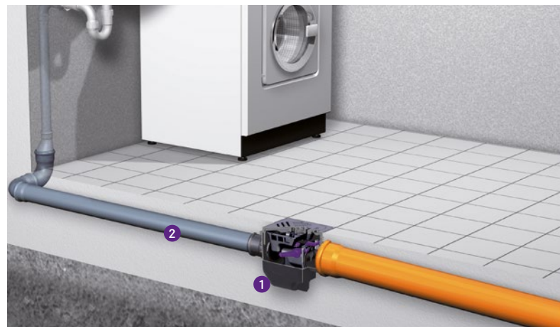
1 Drain 2 Inlet

The Drehfix is a basement drain with integrated, removable backwater valve (Type 5). In addition, it protects connected discharge points such as washbasins, showers or washing machines against wastewater from the sewer. With odour trap, sludge bucket, manually locked emergency closure and a discharge rate of 1.8 l/s, it can be used flexibly and is so compact that it fits in the recesses of old cast iron drains. It is therefore ideally suitable for renovation projects.