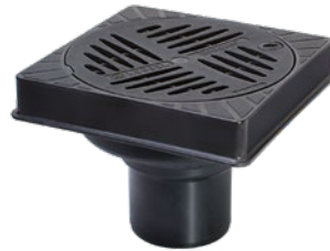
Illustration shows Art. no. 67 110B