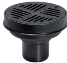
Illustration shows Art. no. 67 111B