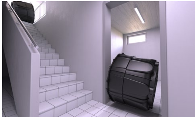
Illustration shows Art. no. 93 002-R