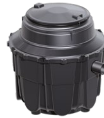
Illustration shows Art. no. 93 001

➤ Accessories for NS 2 / NS 3 / NS 4: Sampling chamber, refill inlet, inspection window, SonicControl from page 361 – 363, lifting stations see chapter "3"