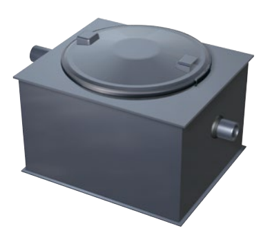
Illustration shows Art. no. 97 202/000